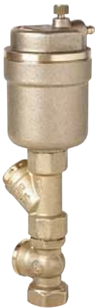
Type YAC-3M Multi-functional air vent valve (air vent + strainer + stop valve)